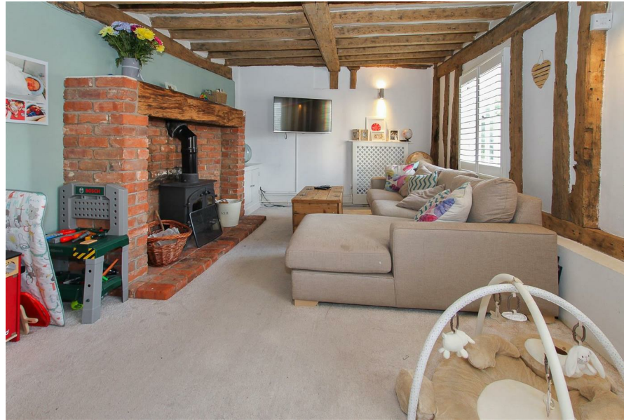
Little Jordan Church Street, Blackmore, Ingatestone, CM4 0RN

** ONLINE VIEWING AVAILABLE - ON REQUEST ** Offered for sale is this character, grade II listed, end of terrace cottage in the desirable village of Blackmore, with primary school, village shops, tea room, pub and village pond. The property has been sympathetically refurbished, yet still retains plenty of character and some original features, including beam work to walls and ceilings, sash windows and feature fireplaces. There are three bedrooms and a shower room to the first floor, with the ground floor accommodation comprising of two receptions, ground floor bathroom and a modern fitted kitchen with stable door leading to the rear. Externally the property has a rear garden measuring approximately 68' (max) and has off street parking to the rear for two vehicles.